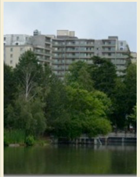
A view of my new home taken from Victoria Park, Kitchener, ON.

My compass is pointed to friendships, manifesting a peaceful living space and a more productive, active life.